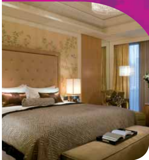
Sofitel Wanda Beijing