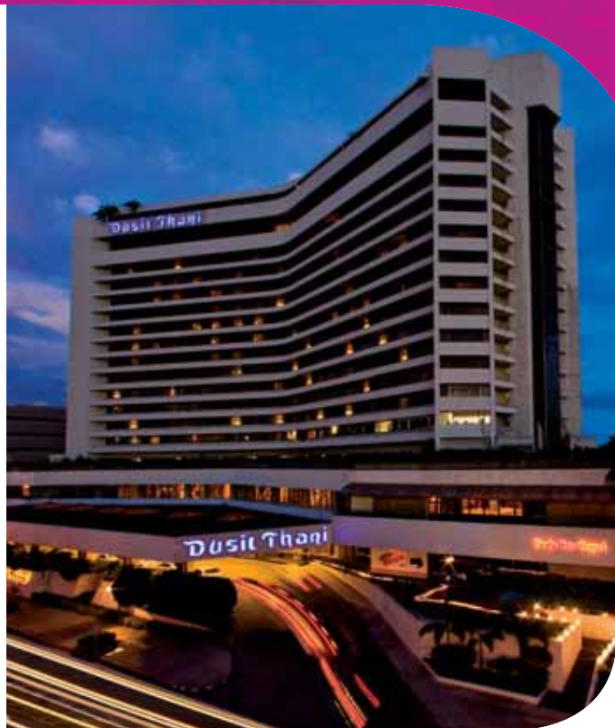
Dusit Thani Manila