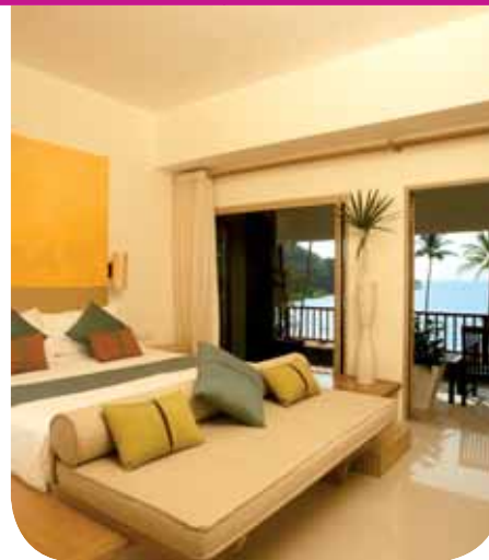
Dusit Princess Koh Chang

Sofitel Dalat Palace Sofitel Plaza Hanoi Sofitel Saigon Plaza