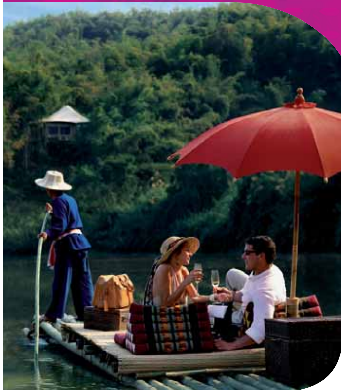
Chiang Rai, Four Seasons Tented Camp Golden Triangle