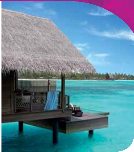
Shangri-La's Villingili Resort & Spa, Maldives