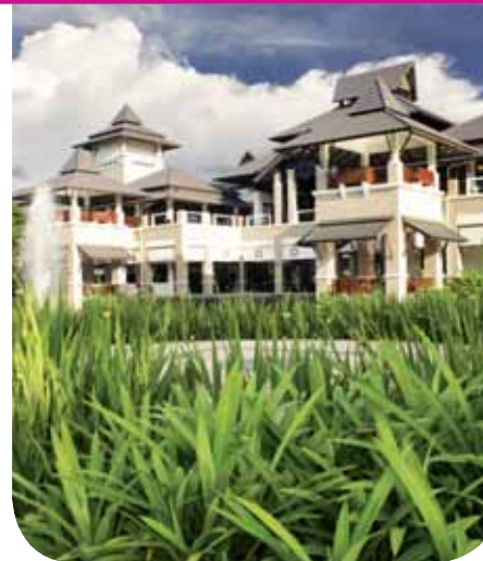
Le Méridien Chiang Rai Resort