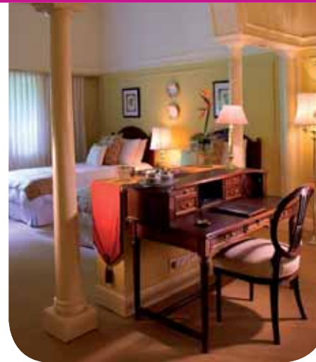
The Claridges New Delhi

Conditions: Offer valid from September 1 - October 31, 2009, subject to availability. This offer is valid for Public Rates only and applicable for only two adults. The 4-night short stay offers the 4th night free after 3 paid nights (quote Rate Code: SR0P4N) and the 7-night stay is 6th & 7th nights are free with 5 paid nights (quote Rate Code: SR0P7N). Free night(s) must be combined with the paid nights in the same stay. The supplement of additional persons will be charged for the entire duration of stay. May not be combined with other promotions. Other terms and conditions apply.