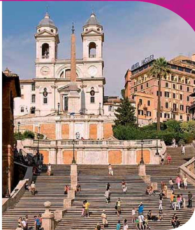
Hotel Hassler, Rome - Italy