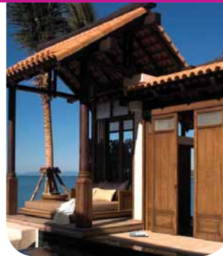
Langham Place Samui at Lamai Beach