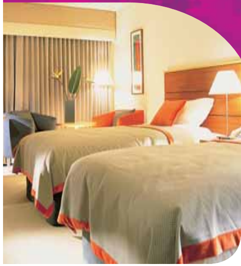
Millennium Madejski Hotel, Reading, U.K.