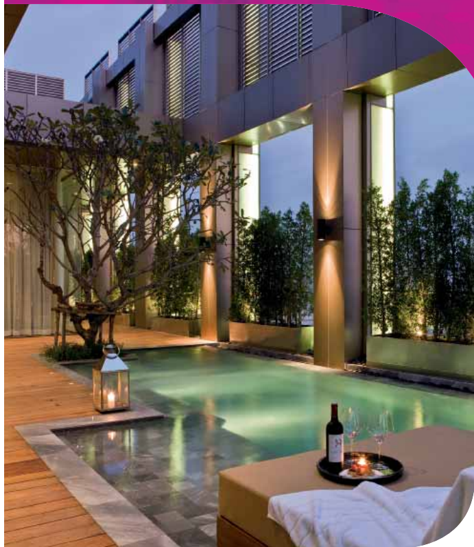
VIE Hotel Bangkok